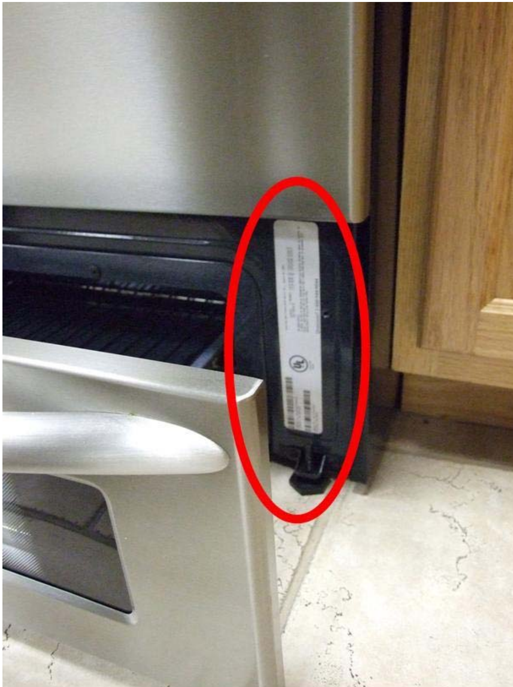
Serial plate is located by opening the range drawer at the bottom of the unit.