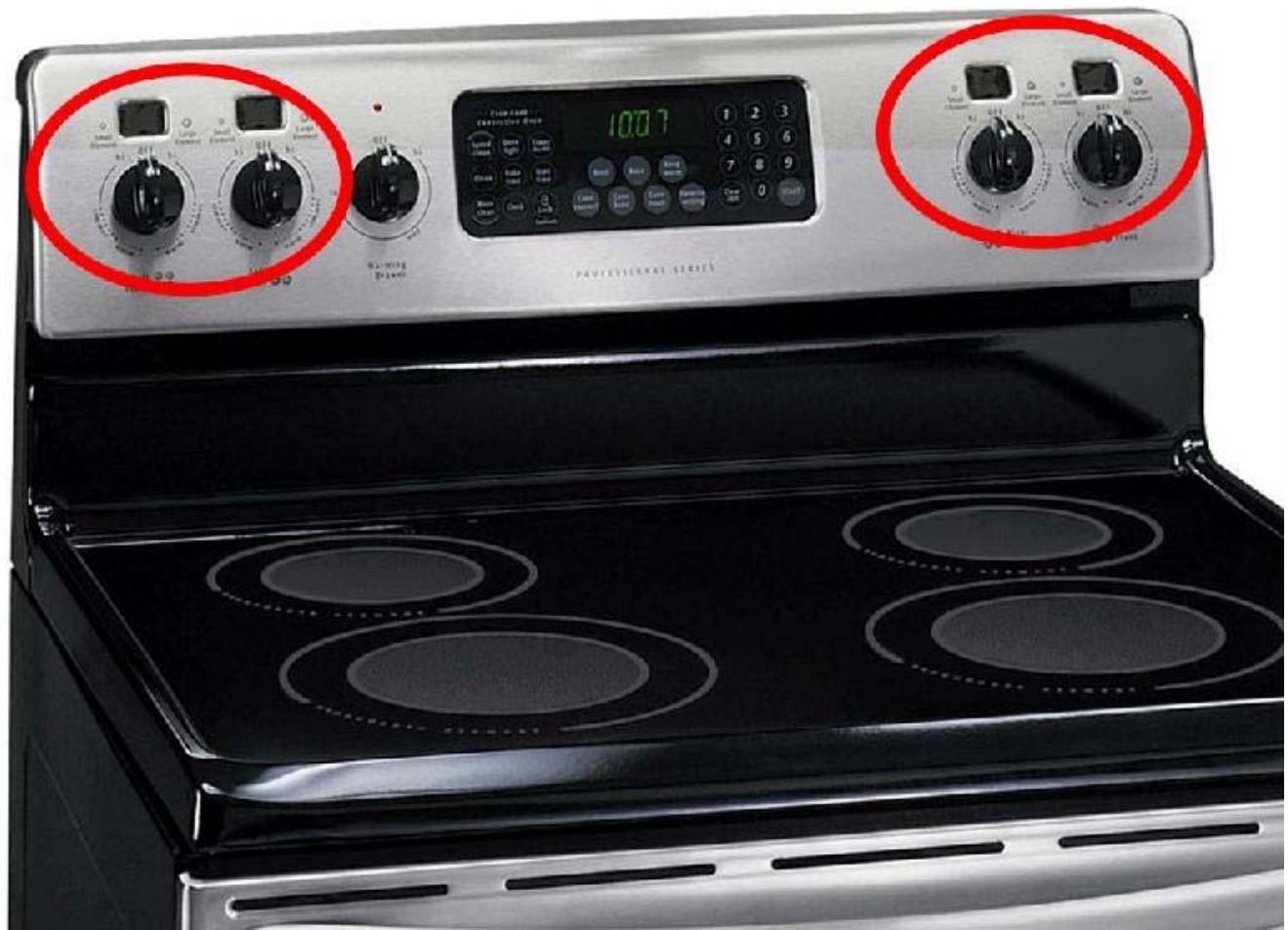
Sample of a smoothtop range with rotary knobs and digital displays

through Saturday or visit the firm's recall Web site at www.smoothtoprangerecall.com . Consumers who purchased their products at Sears should call Sears at (800) 449-9810 between 8 a.m. and 10 p.m. ET Monday through Saturday.